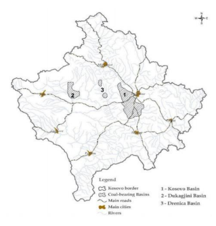
Figure 5: Coal regions in Kosovo

There are three lignite coal mines operating on the territory of Obilić: Belaćevac, Miraš and Sibovc, with coal being the main resource for the power plants Kosovo A Power Station and Kosovo B Power Station.<sup>80</sup>