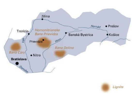
Figure 4: Slovak lignite regions Source: Euracol (2019) Slovakia

The Horná Nitra region, including the district Prievidza, is the country's main lignite basin and part of the administrative region of Trenčín. Trenčín has 592,400 inhabitants, representing 9% of the country total. The industrial sector provides almost 50% of the jobs in the Trenčín region. Unemployment has been declining due to the arrival of new multinational investors in the region and was 6.1% in 2017, which is below the national and the European average. <sup>58</sup>