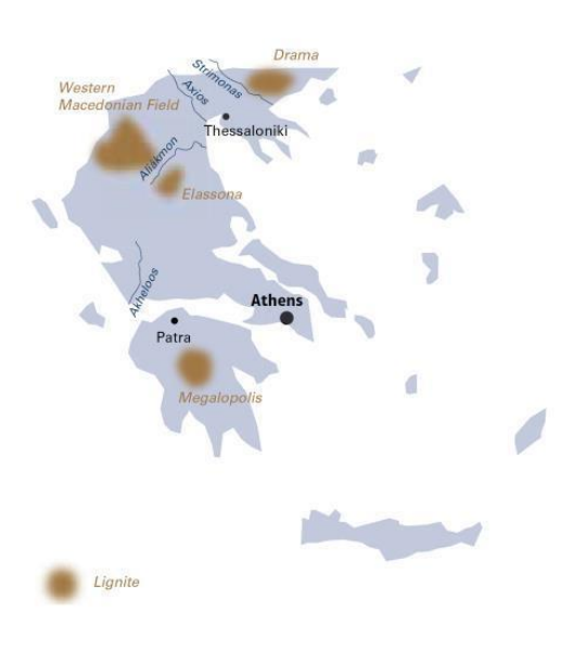
Figure 2: Greek lignite regions Source: Euracoal (2019) Greece

Eight of the nine remaining lignite mines are in Western Macedonia. The mines are in Ptolemaida, Amynteo and