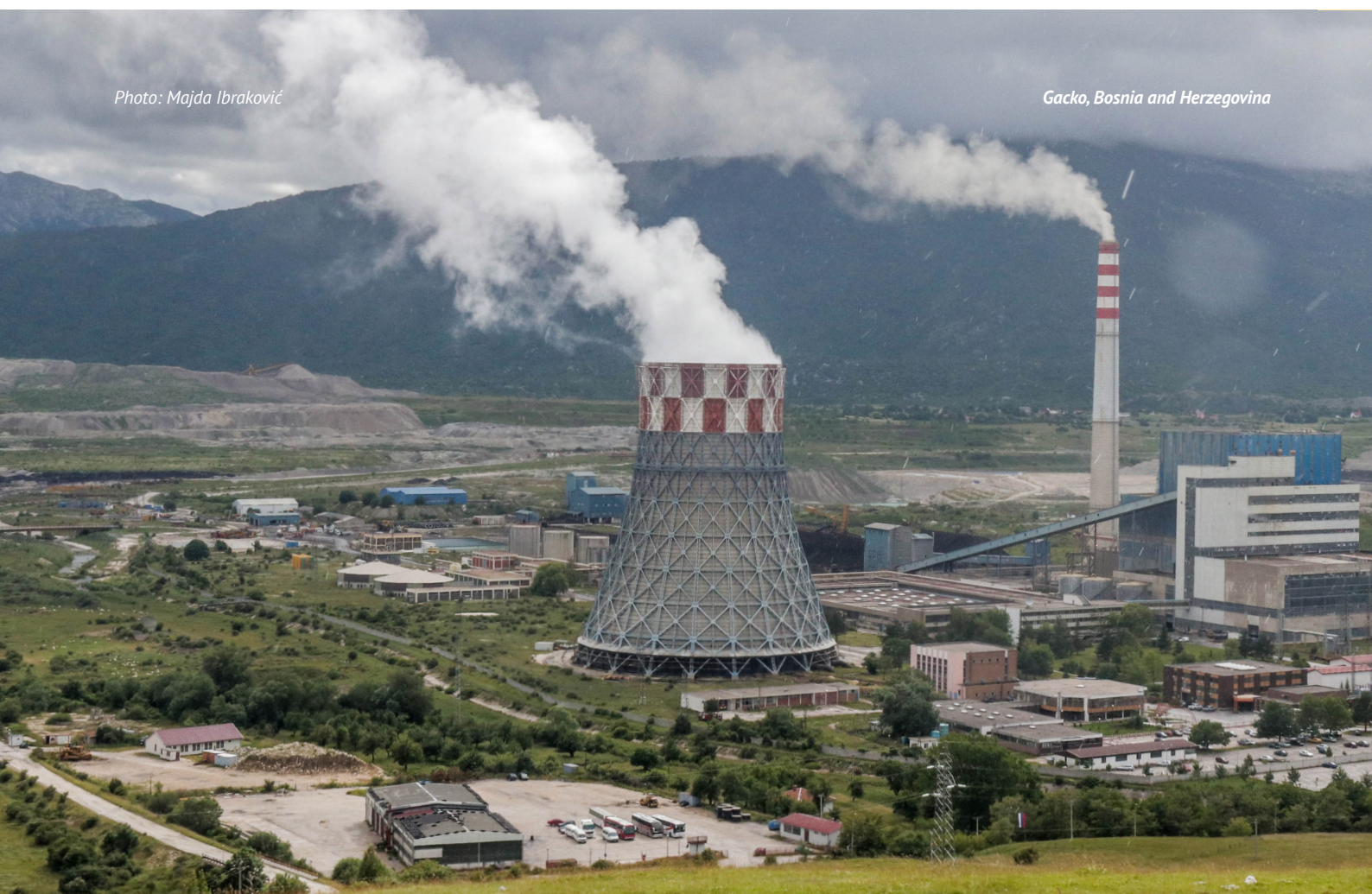
Gacko, Bosnia and Herzegovina