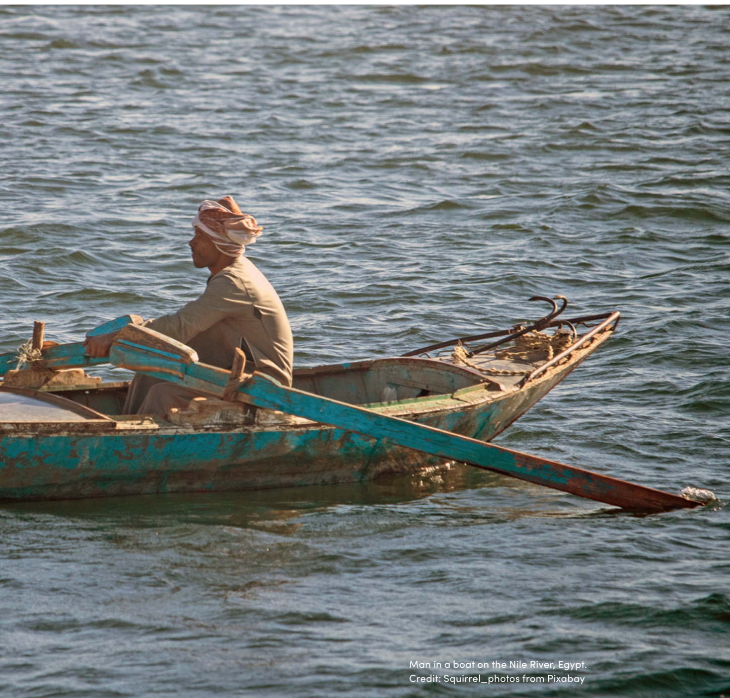
Man in a boat on the Nile River, Egypt.

The case suggests that support to effective climate adaptation in one riparian country could mean negative, even devastating, impacts in a neighbouring country. Hence, just adaptation to climate change, and just transition to a more sustainable use of water for agriculture in a shared river basin would need to take a basin-wide approach when planning for interventions.