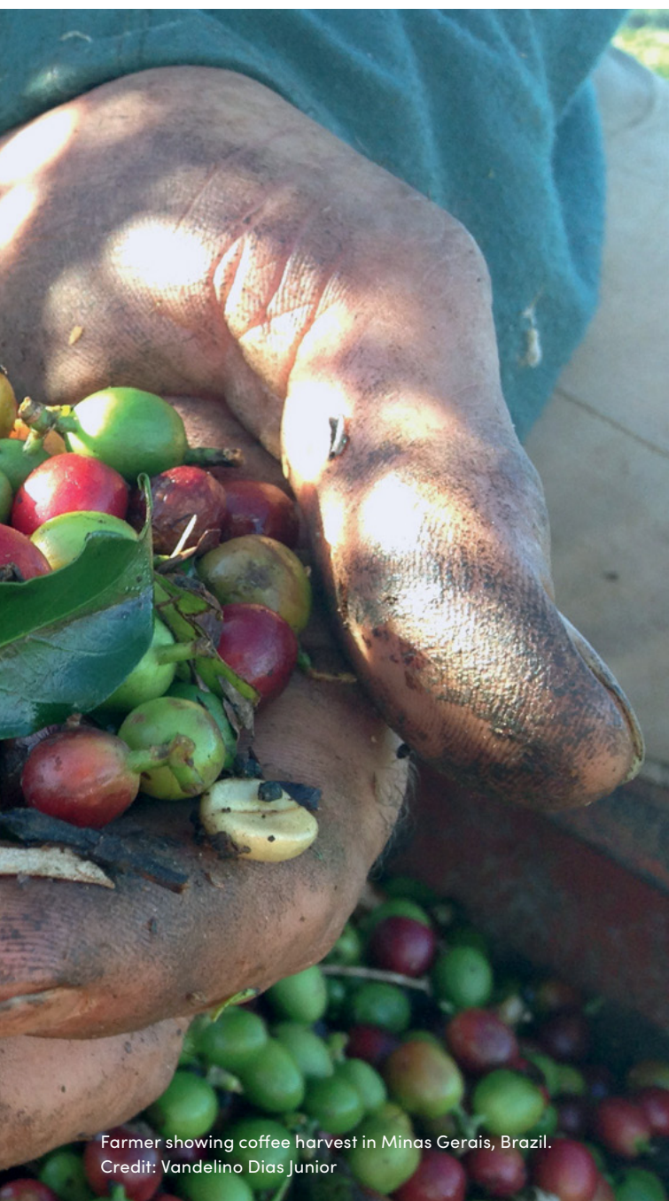
Farmer showing coffee harvest in Minas Gerais, Brazil.

In sum, the Brazilian coffee sector – and agricultural commodity trade more broadly – provides an important opportunity to facilitate a just transition for adaptation. Without deliberate attention to justice, a more connected approach to adaptation risks leaving vulnerable actors behind and increasing risks to human security as livelihoods are harmed or lost. By explicitly considering procedural and distributive justice as we pursue adaptation action, it is possible not only to support vulnerable producers and communities as we manage transboundary climate risk, but also to further engage the private sector in climate risk management and improve multilateral cooperation.