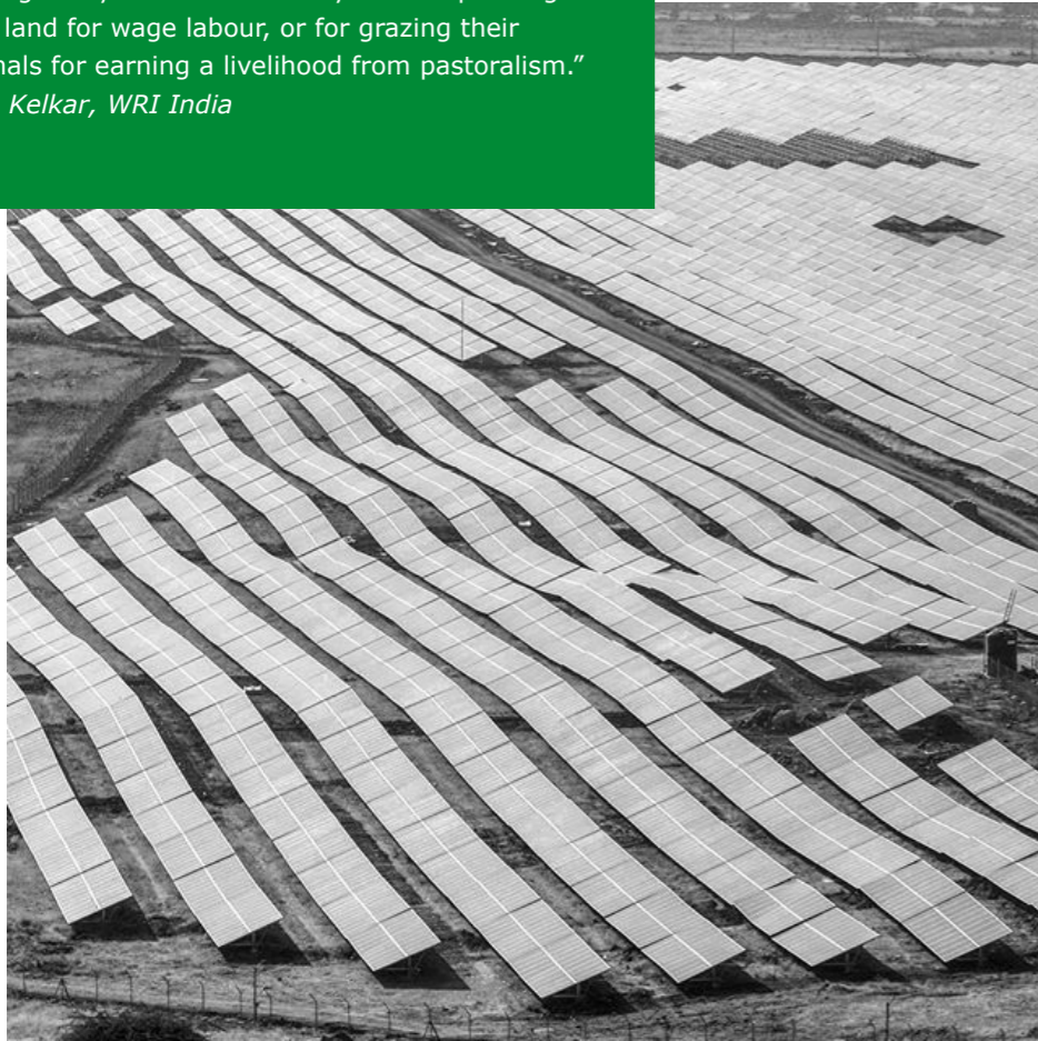
Solar panels Pavagada in Tumakuru district of Karnataka