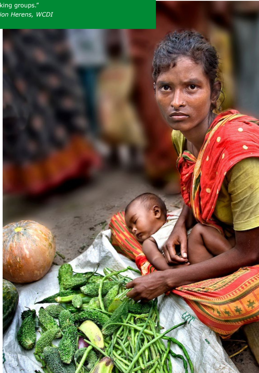
Micro Market -Dhaka mother and child (2007)