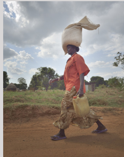
It is often better to provide tax-funded social protection to those who suffer loss and damage, in particular for poor communities, rather than relying on private insurances. The woman in the picture walks along a road in Kotobi, South Sudan.

There are therefore often good reasons to provide tax-funded social protection to those who suffer loss and damage, in particular for poor communities, and not rely on private insurances and let loss and damage create a new market for private insurance companies.