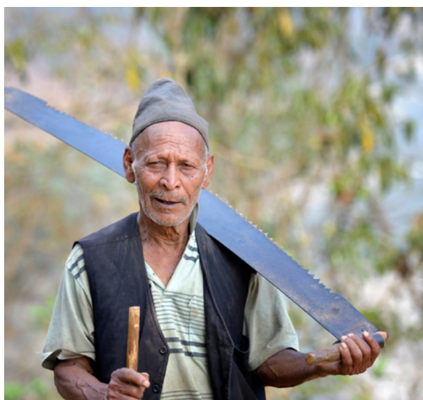
Nepal is a low-income country where everyone of 68 years or above is entitled to an old-age pension. This man lives in Majhitar village in Nepal's Dhading District.

Social protection must first and foremost be financed by the countries themselves, through social security contributions and taxes. International development cooperation may also be needed to support the establishment of social protection floors, especially in the weakest economies. Today, a very small part of all development cooperation is used to