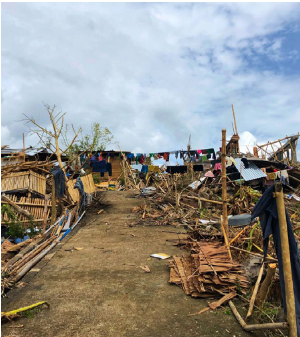
Typhoons, floods and landslides are example of extreme weather events that are becoming more frequent and create risks for individuals and societies that homes and infrastructure are destroyed. The picture shows impact of typhon Goni in 2020 in the Philippines, when 1 million people were evacuated.

Whether sudden or slow, these events lead to disrupted or lost livelihoods and incomes, food insecurity, negative effects on health , temporary or permanent displacement, and distress migration where women and families are often left behind by migrating husbands. Women are due to many