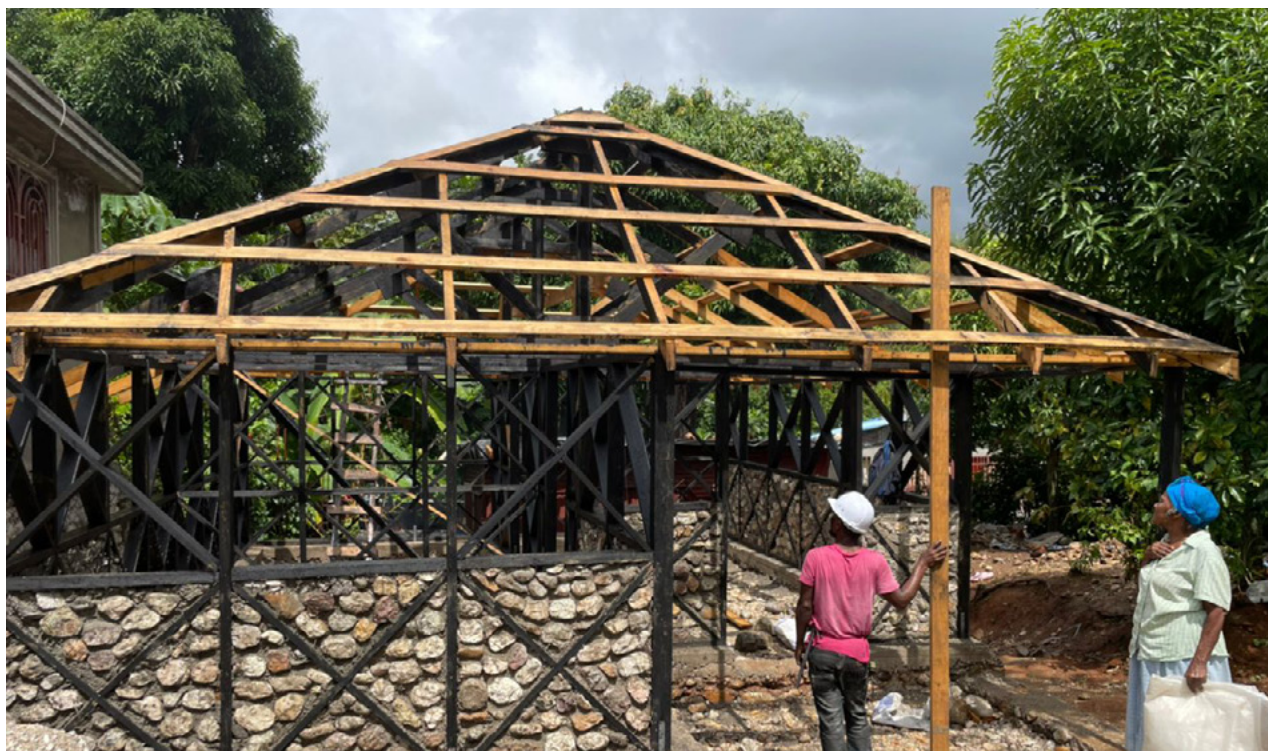
Efforts to respond to loss and damage must not only be short-term, but support capacity for resilience and contribute to medium and long term recovery. In the picture Marie Nusia, participant in a LWF project in Haiti, observes the progress on her new hurricane and earthquake resistant home.

7. Plan for uncertainty. Make sure national social protection systems are flexible and can be upscaled in emergencies. Establish early warning systems that trigger quick action.